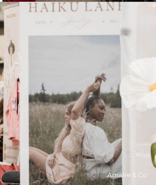
Amaire & Co