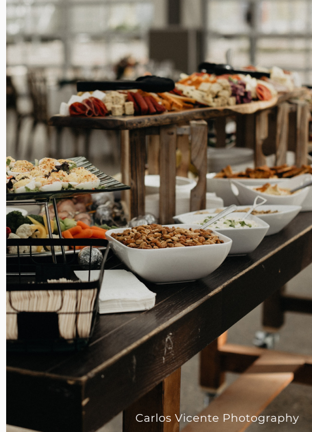
Carlos Vicente Photography

Visit our website for our preferred vendors package.