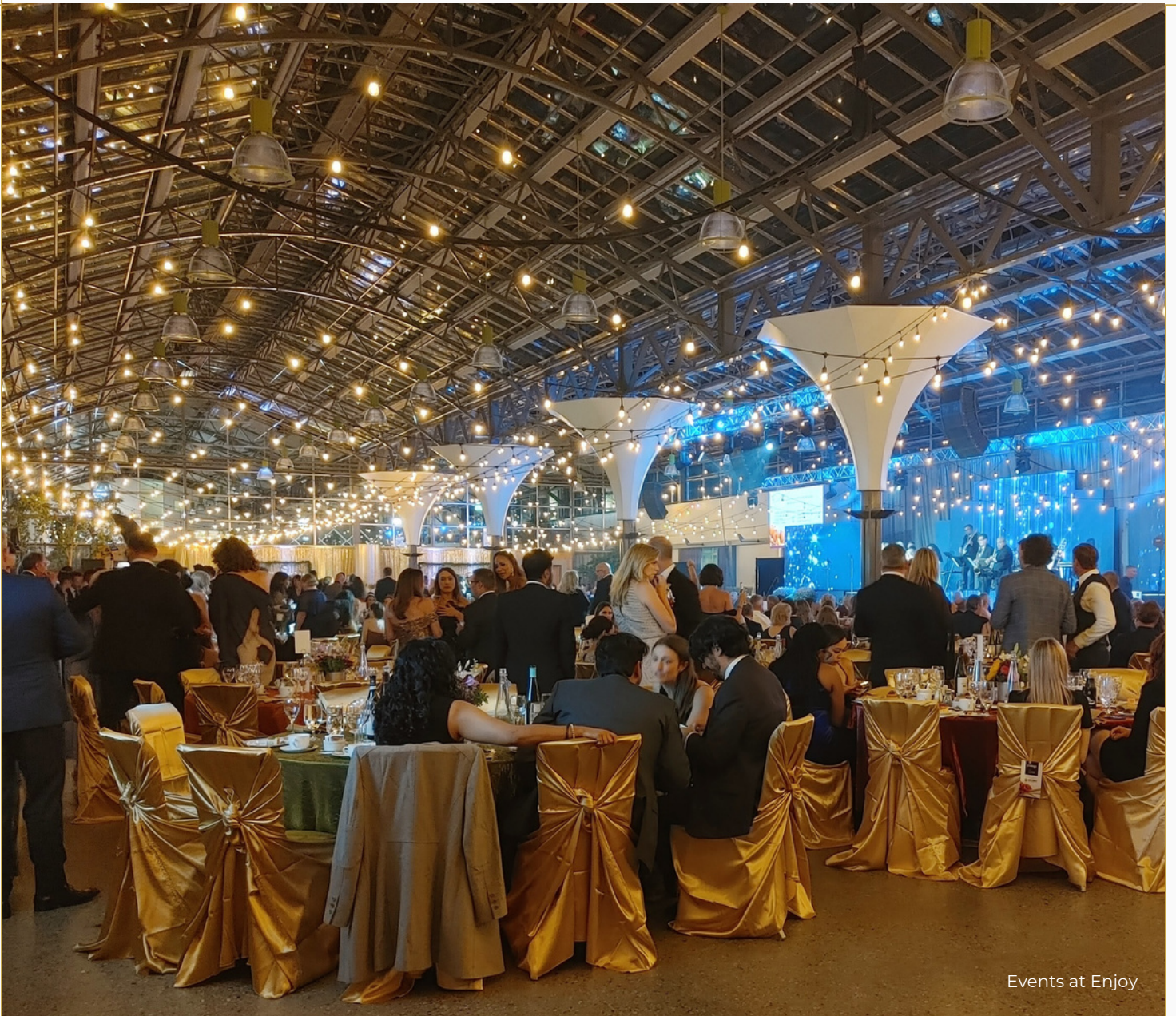
Events at Enjoy