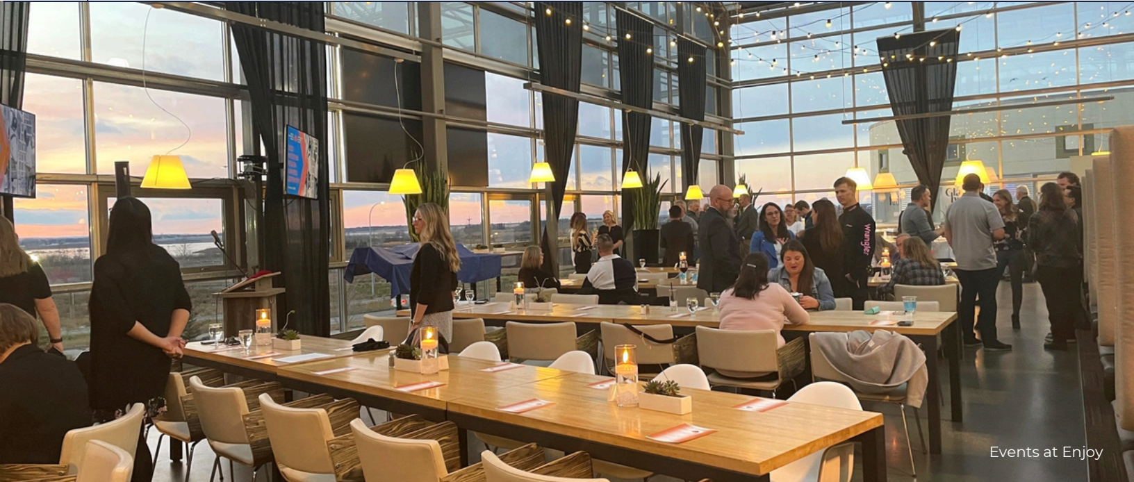
Events at Enjoy