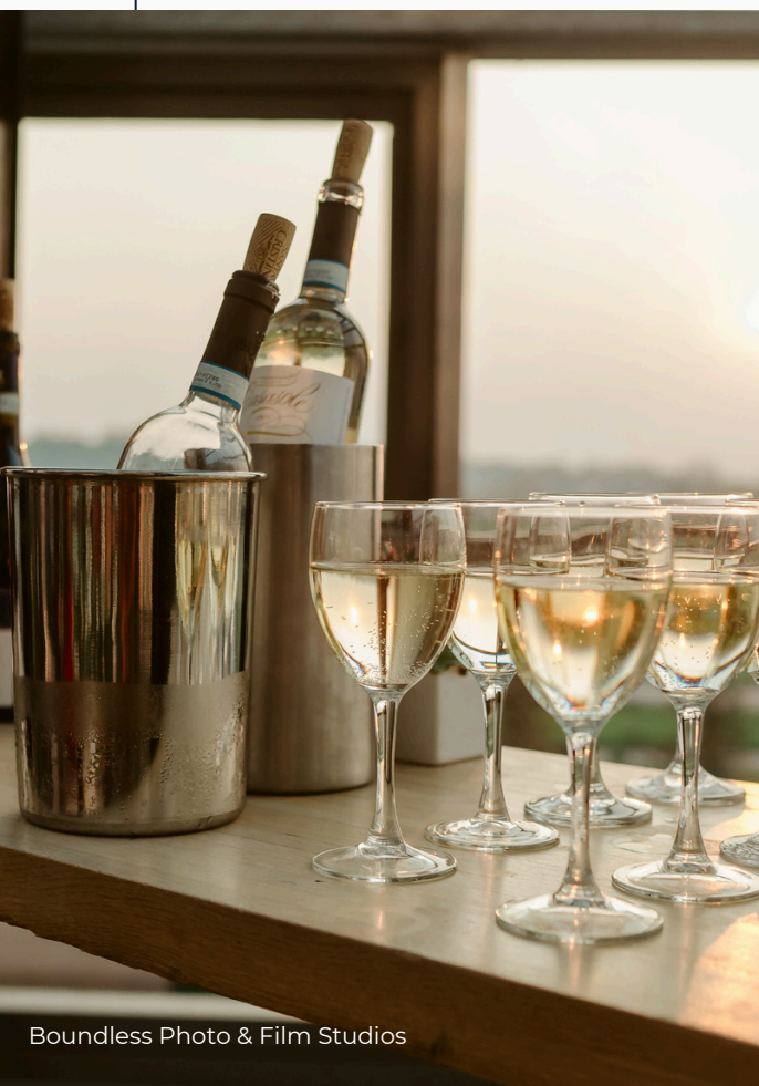
Boundless Photo & Film Studios