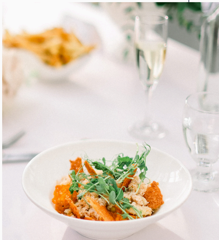
Vicki Zhou Photography

Inquire for the latest Event Catering Menu.